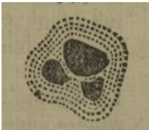
Figure 4: A close-up sunspot drawing at 15 LT on 11 September 1671, adopted from Hook (1671).

Cassini (1671a, 1671c) predicted the sunspot recurrence in September. This prediction was likely