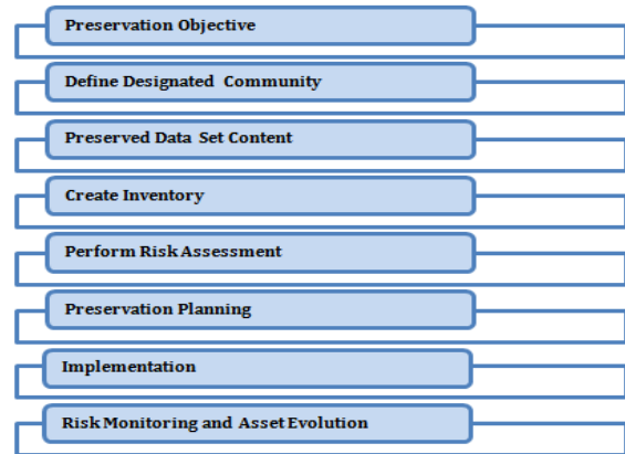
Figure 1. Phases of Preservation Archive Creation

We have defined the following logical model as a guideline to structure the archive definition phase workflow (Figure 1).